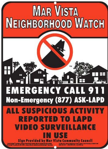
18"x24" Engineering Grade Reflective Neighborhood Watch Street Signs Provided by the Mar Vista Community Council