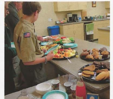
Whole Foods donated refreshments!

At 7:00 PM, Congresswoman Karen Bass, for the third year in a row, presented us with an update about D.C. politics. She was only able to stay until 7:30 PM, due to scheduling constraints. She reported that she is in process of drafting a letter regarding our Santa Monica Airport issues, and answered a number of questions from the audience.