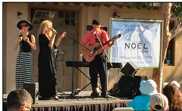
The Polytones