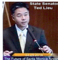
The Future of Santa Monica Airport