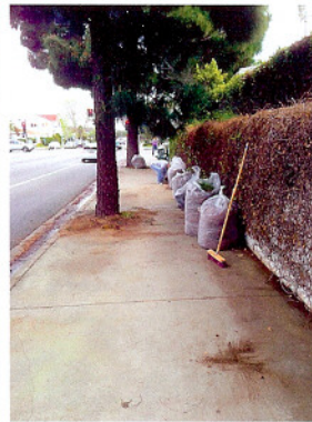
Looking south on Bundy from Ocean Park